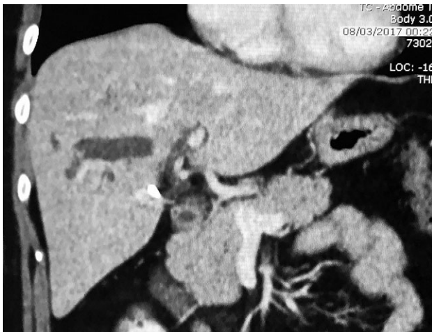
Figure 1: Abdominal computed tomography with stones.

Laparoscopic cholecystectomy is the gold standard treatment for symptomatic gallstone disease. Since its introduction, surgical endoclips have been routinely used to control the cystic