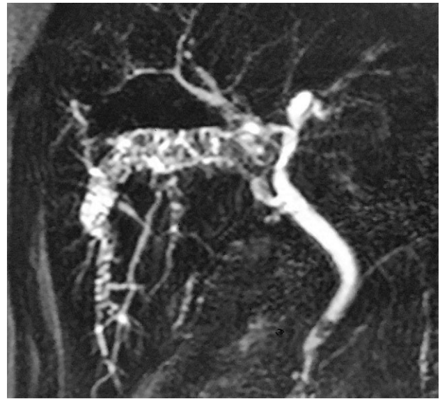
Figure 2: MRCP dilated intrahepatic bile duct with stones.